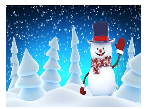
Wishing you a wonderful holiday season and all the best in 2024!